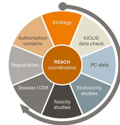
An overview of our services